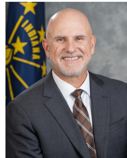
Sen. Scott Baldwin Envoy